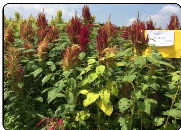
(a) SKNA-808 (G 2 )