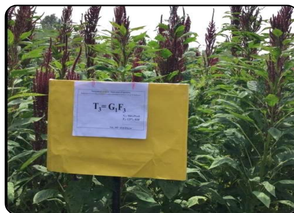
(b) SKGPA-61 (G 1 )

Plate1: Performance of genotype (a) SKNA-808 (G 2 ) and (b) SKGPA-61 (G 1 ) nutrient uptake by Grain amaranth